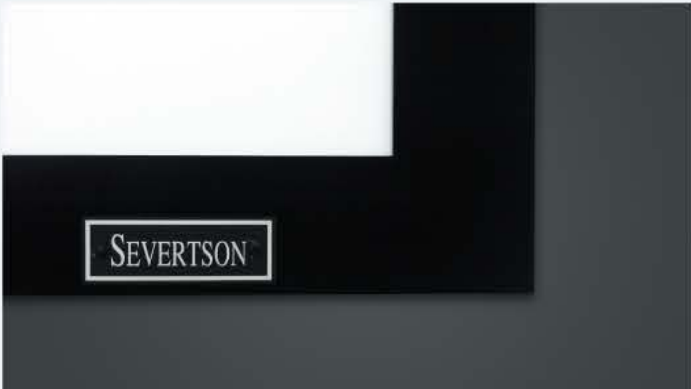
The velvet-wrapped frame provides a clean, crisp viewing edge.

Note: The most common sizes and aspects are listed here. Visit severtsonscreens.com/model/LF for more available sizes and specifications.